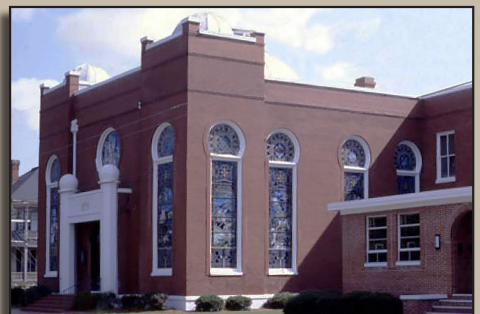
Temple Sinai in Sumter, SC.