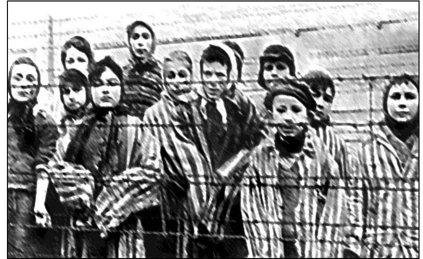
Child Survivors of Auschwitz Concentration Camp

Holocaust Remembered is a unique exhibit that honors the survivors and victims of the Holocaust by telling the personal stories of South Carolina survivors and liberators.